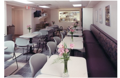
Battered Women's Shelter Dining Area