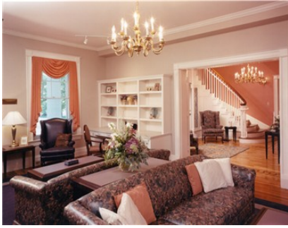
Shelter Living Room Area